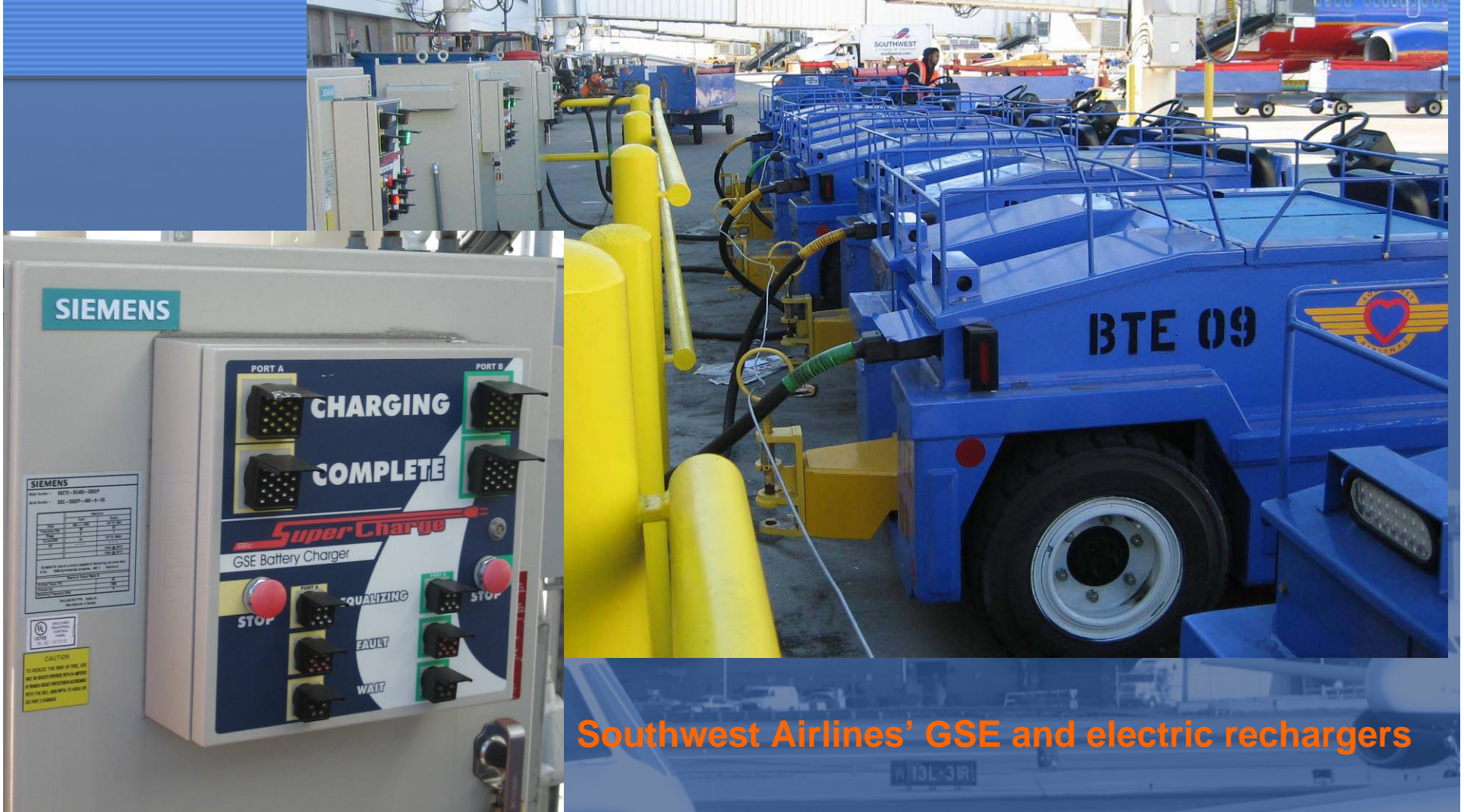
Southwest Airlines' GSE and electric rechargers